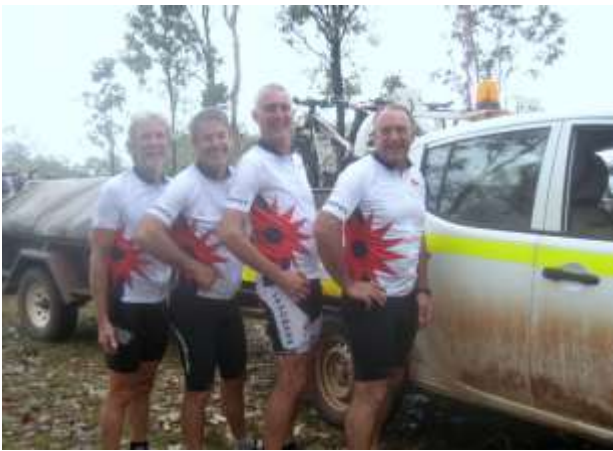
Camping facilities at Ellenbrae Station were great but turned very boggy after a night of heavy rain to the point where many 4WD's got bogged leaving.